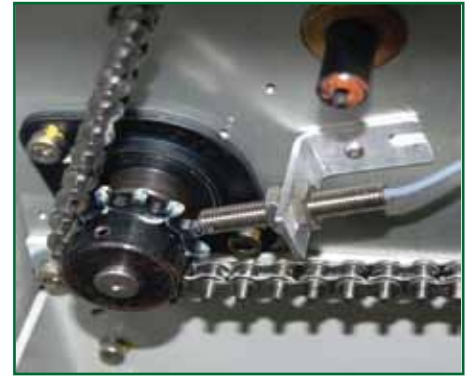
The APS system incorporates independent sensing and verification of machine conveyor speed.