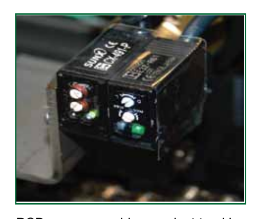
PCB sensor provides product tracking and intelligent process history recording.