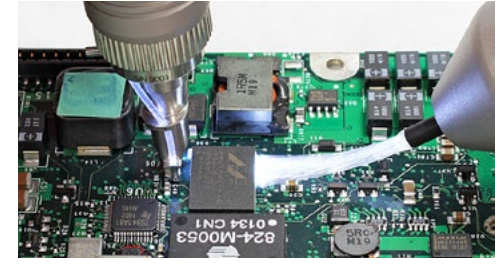
Inspection of a micro-BGA

The practical aluminium case for he Ersa MO-BILE SCOPE offers safe storage of the inspection items and transportation of the system to any location wherever it is needed.